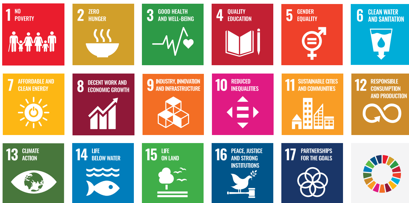
Figure 2:2 SDGs to be Considered in the Strategic Plan